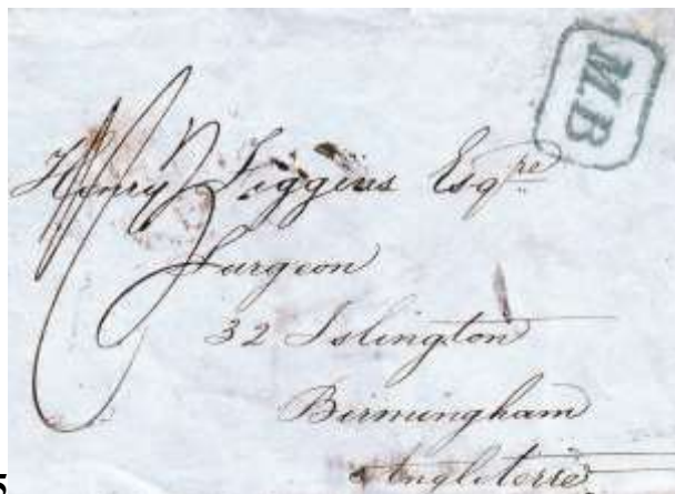
Lot No. 75