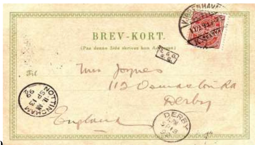
Lot No. 110