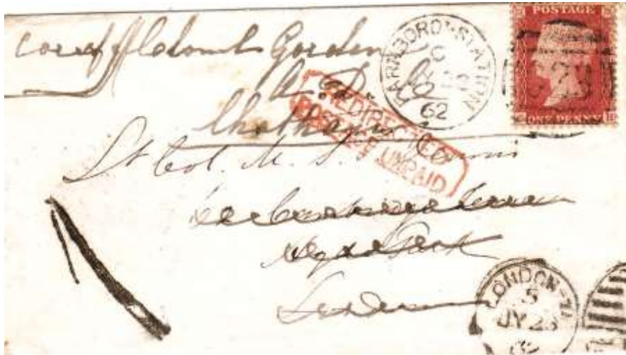
Lot No. 86