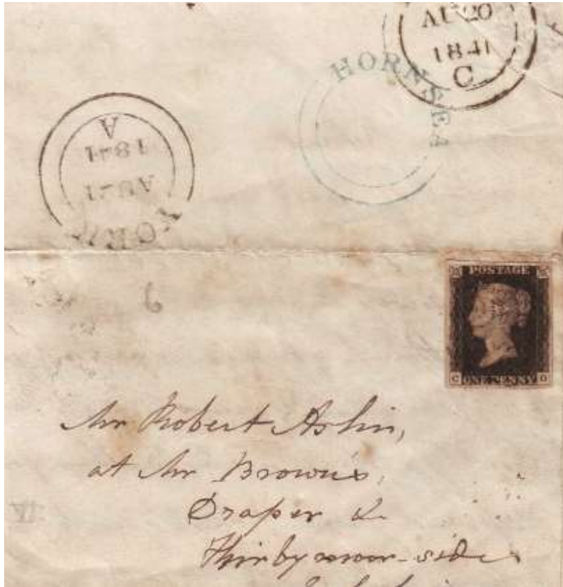
Lot No. 65