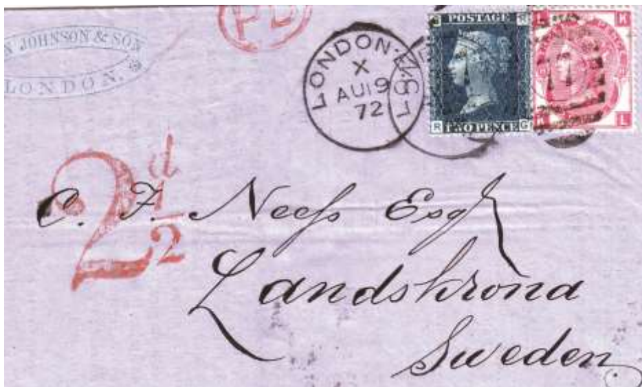
Lot No. 95