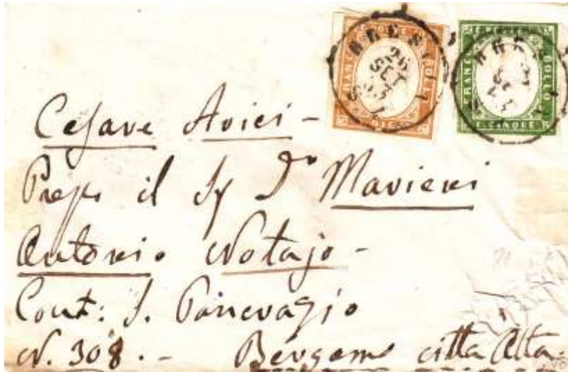
Lot No. 153