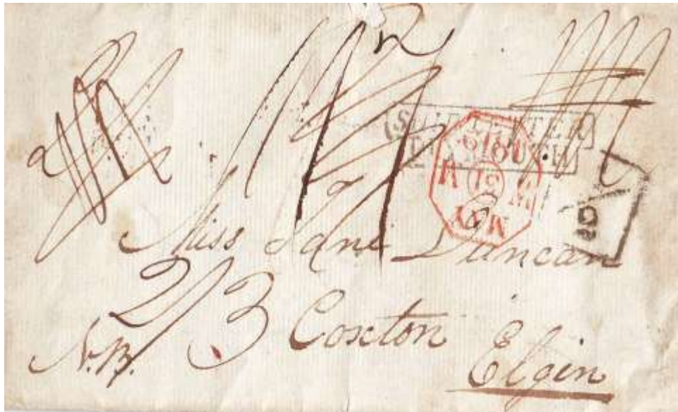
Lot No. 183