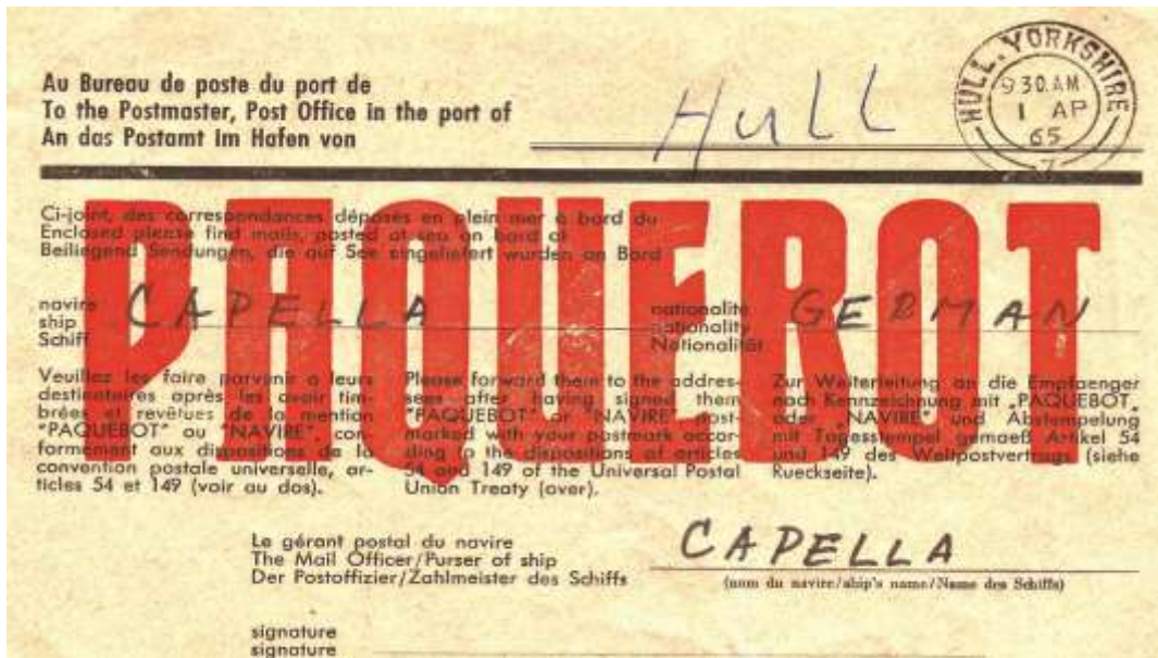
Lot No. 137

A Szamosújvári újság, Várnagyfal 17/2 50. 8/18. A Szege, Piráhyi Fő Normányi R. E. her- alárator, típlettel Hool Polosvárot