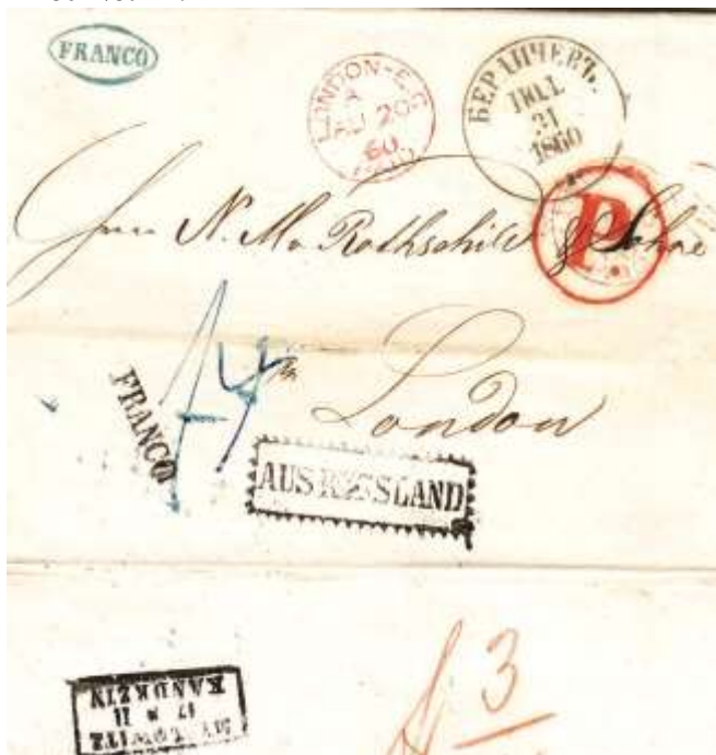
Lot No. 179