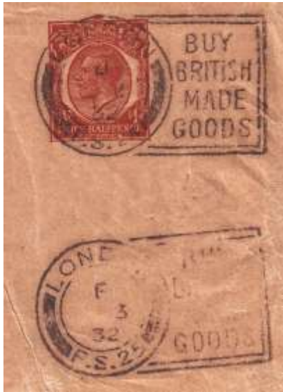
Lot No. 124